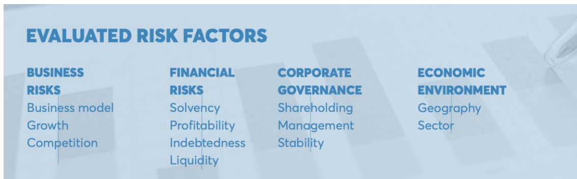
Figure 1. Description of evaluated risk factors:

A rating notch is calculated through the assessment of the 4 types of risks mentioned earlier, and according to the following to two modules: